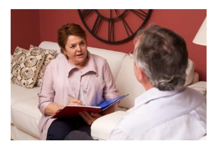
Confidential interviews with family

Funeral celebrants are independent and work confidentially so feel free to contact an FCAA Celebrant and ask questions about a funeral or memorial service. See helpful Q&A over page.